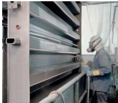
Metal surfaces are coated with a two-part epoxy finish to protect against corrosion.

The end result is a durable finish that protects against the corrosion and contaminants that can shorten the life of a scale.