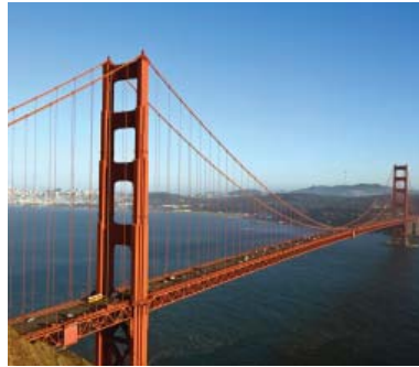
Our scales have the same orthotropic design used for the Golden Gate Bridge and many other high-traffic roadway bridges.

When a highway bridge fails, the results can be catastrophic. Many bridge designers are now turning to orthotropic ribs as a better alternative to conventional I-beam structures because of the proven strength, reliability, and longevity. They know that the strength and durability of a weighbridge has more to do with how the steel is used than with how much steel is used. Don't let a failed weighbridge be catastrophic for your business.