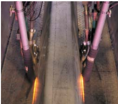
Modules are robotically welded to meet the highest quality standards.

The result is the same high quality for every scale, every time.