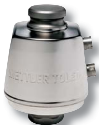
POWERCELL PDX Load Cell

Upgrade your scale to POWERCELL® PDX® technology and experience the ultimate in reliability. POWERCELL PDX load cells eliminate the need for maintenance-prone junction boxes, totalizers, and sectional controllers.